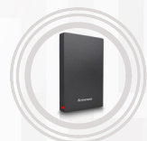
Lenovo UHD F309 1TB Portable Secure Hard Drive