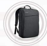
Lenovo Casual Backpack B200