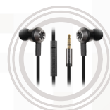
Lenovo 500 Extra Bass In-Ear Headphone