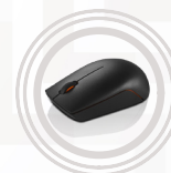
Lenovo 300 Wireless Compact Mouse